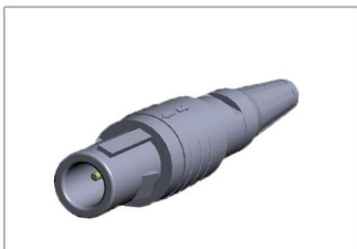
Cable Mount w/ Boot