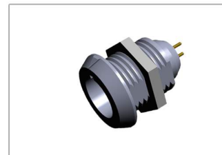
Vertical Mount - Fixed Nut