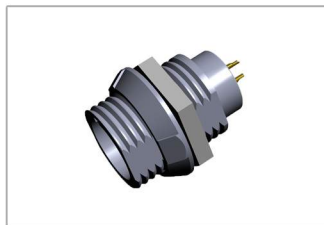
Solder Cup - Two Nut