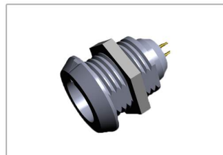
Solder Cup - Fixed Nut