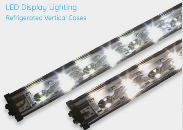
LED Display Lighting Refrigerated Vertical Cases

A snap in board locking system on the male header added another layer of stability to the overall connector system which resulted in a significant design win for NorComp.